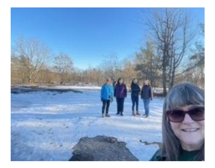
A few of our club members recently attended a Winter Camp. Snow was sparse but it was still an enjoyable weekend for all.