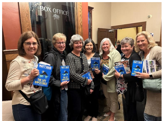
An enjoyable evening was had by some of our members who attended the Matt Haig book night at the Book Drunkard Literary Festival in Uxbridge.